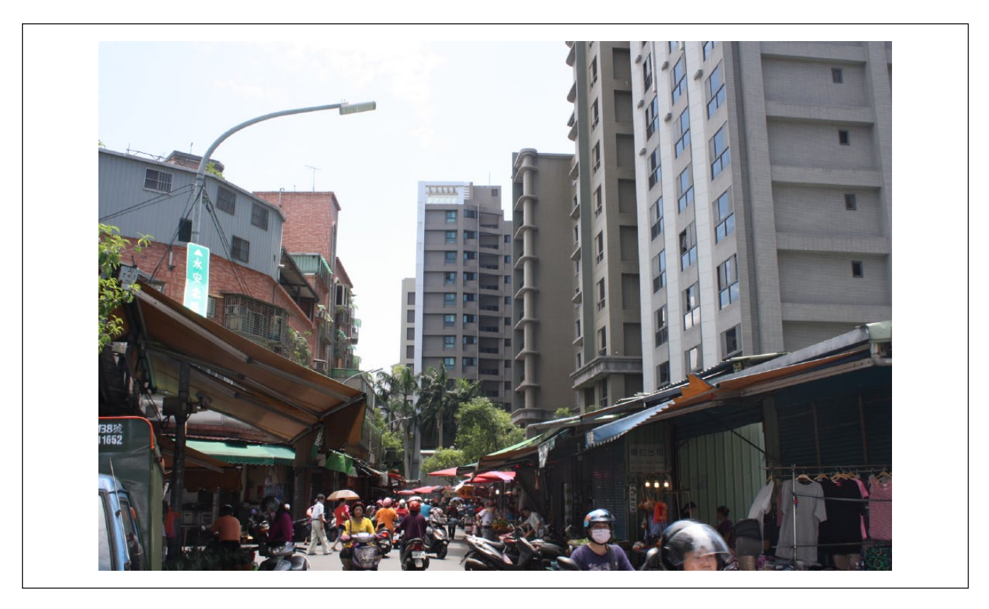
Figure I. A transfer of development rights (TDR) development (right) and an existing community (left) separated by a street market.

planning challenge of the "reserved land (baoliudi)" issue urged city government planners to look for a market-based compensatory mechanism. Reserved land is an official term used in government documents to describe privately owned land that has been deprived of development potential as a result of being zoned for public facilities-such as roads, parks, schools, etc.-but whose landowners have yet to receive monetary compensation due to fiscal deficiency. This thorny issue historically originated in the urban planning practices under Japanese occupation (1895-1945) and continued to worsen in the 1960s and 1970s when most resources were directed to national economic development in Taiwan (Shih and Chang 2016). Once a parcel is designated as reserved land, no development can take place there with the exception of minimal, low-rising constructions for short-term uses, such as parking grounds. It is estimated that there are currently 25,000 ha of reserved land in Taiwan, of which New Taipei City accounts for 25 percent (Xu and Zeng 2013). At the central level, there has been a shift in economic development strategy to focus on promoting urban redevelopment in the city (Hsu and Hsu 2013), and establishing "a free market of transferable development rights" was seen as a key to stimulate market interest in real estate development (Ministry of the Interior 1997, 58). The outcome is a TDR policy that is both pragmatically and ideologically oriented toward real estate development.