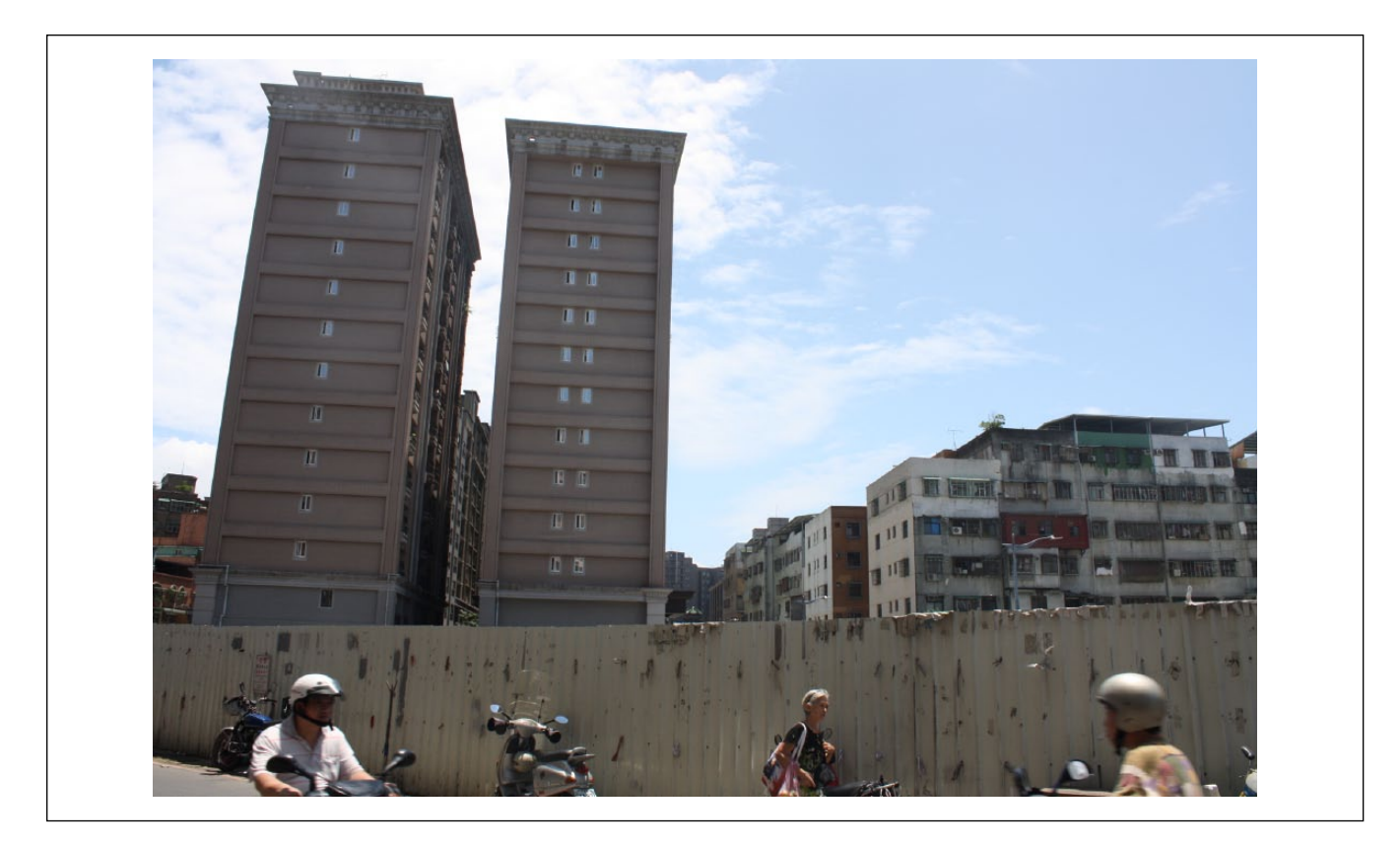
Figure 2. New transfer of development rights (TDR) developments (left) stand side by side with existing apartments (right).

between market participants without regulatory constraints. In practice, "brokers" who specialize in local land deals function as mediators between individual reserved landowners and private developers. While the dynamic of the TDR market is beyond the scope of this article (for a detailed study, see Shih and Chang 2016), it is widely recognized that the negotiation power is in the hands of brokers and developers, because for thousands of reserved landowners TDR is the only channel through which they can receive compensation for the loss of development potential of their lands. However, the TDR market has also energized all participants and effectively smoothed the political pressure of the reserved land issue.